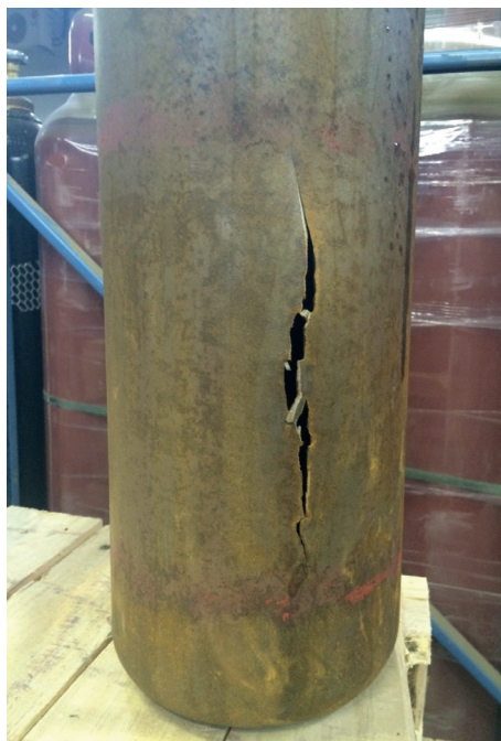
This CO 2 cylinder burst at the sidewall, where it is designed to burst. There was no damage to the equipment.

The burst disk, which is found protruding from the side wall of our jackets, is designed to shatter in event of a cylinder rupture thus preventing pressure buildup inside the jacket. It is made out of crystal glass, which is batch tested to burst at 20-30 psi. This part of the water jacket should never be blocked off with untested regular glass or any other material that is not designed to release pressure instantaneously. Otherwise, damage, like that shown in the first photo, can occur.