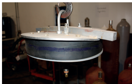
Test head after a cylinder failure.

At Galiso, we take operator safety very seriously and have designed our equipment to withstand a catastrophic cylinder failure inside the test jacket. There are important safety components on the test jacket, to keep the operator safe. For example, there is a retaining bar that is one-inch steel on the test head, which is retained by brackets on the jacket in the event of a cylinder rupture.